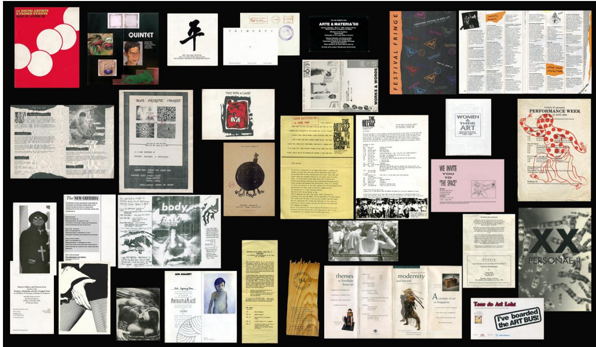
Selection of Art Ephemera, 1986 to 1996.