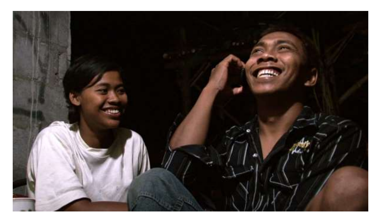
Sun 20 Apr 2014, 3pm <u>Denok and Gareng</u> Dwi Sujanti Nugraheni, 2012, Indonesia, 89 mins, Bahasa Indonesia with English subtitles, (PG13) Some Mature Content