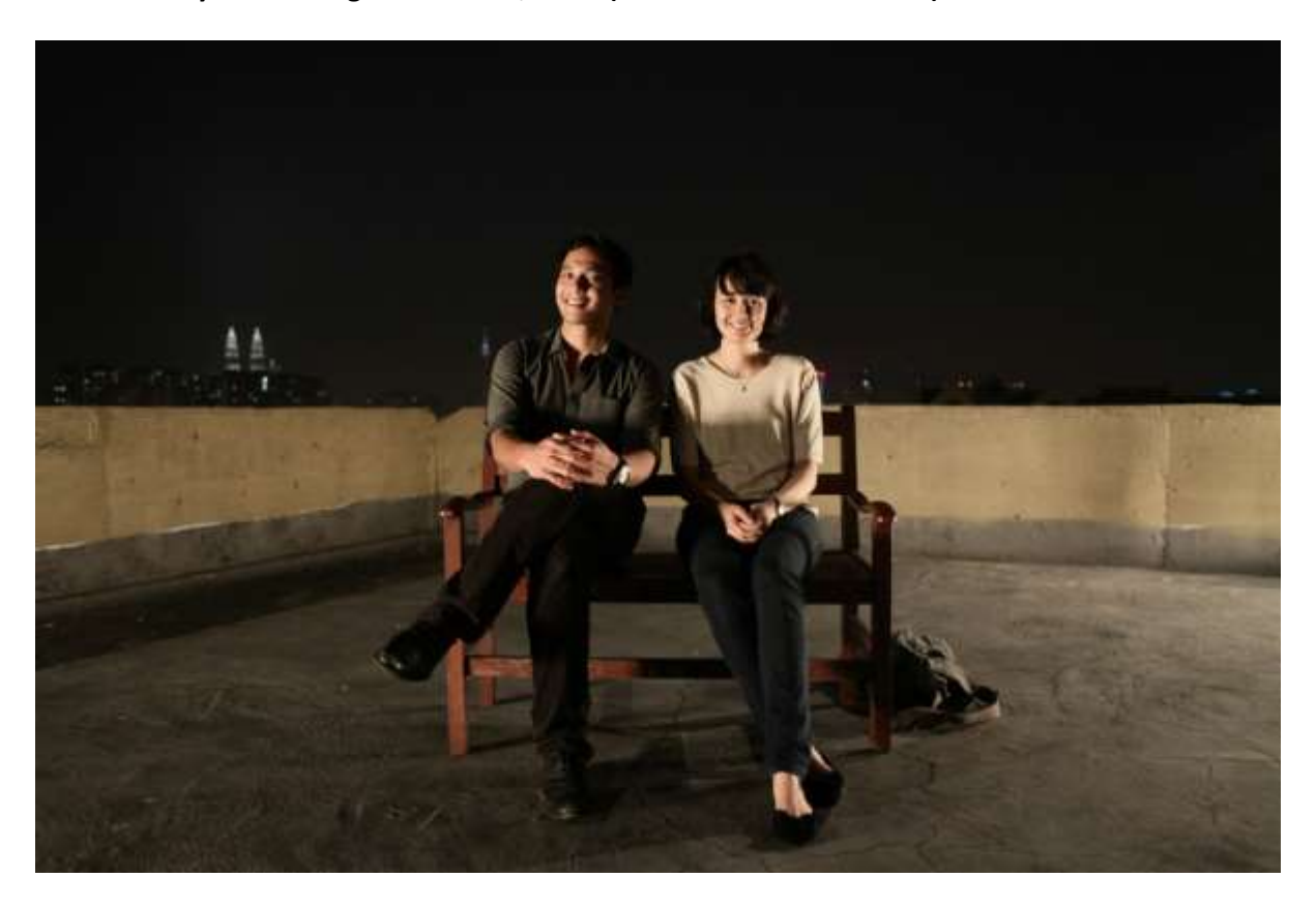
Sun, 13 Apr 2014, 5.30pm <u>KIL</u> Nik Amir Mustapha, 2013, Malaysia, 90 mins, Bahasa Malaysia with English subtitles, PG13 (Some Suicide References)