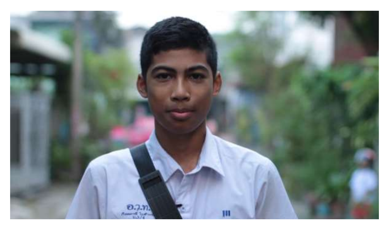
Sat, 12 Apr 2014, 5.30pm <u>Gaddafi</u> Panu Aree, Kong Rithdee, Kaweenipon Ketprasit, 2013, Thailand, 24 mins, Thai with English subtitles, PG