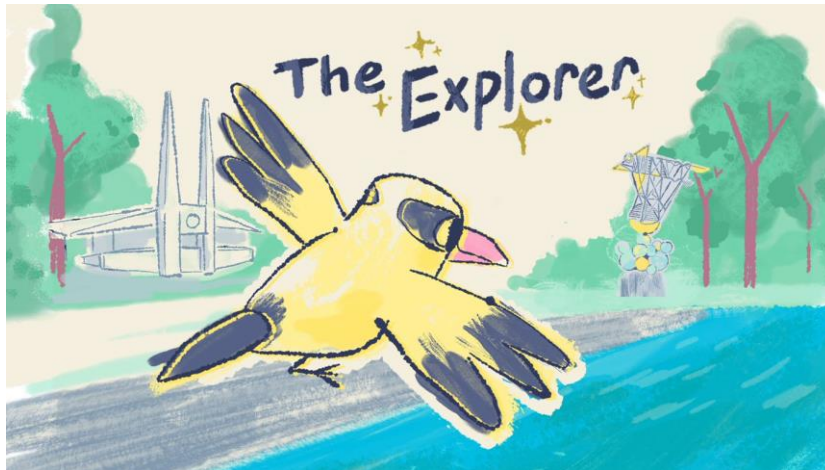
Annuendo, Illustration of The Explorer comic, 2021; image courtesy of Singapore Art Museum

Central to the project is the launch of a new intergalactic comic by SAM, The Explorer , on 20 November 2021. To encourage a more holistic educational approach incorporating Science, Technology, Engineering, the Arts and Mathematics (STEAM), accompanying programmes for children and families include online talks and workshops conducted over Zoom on illustration, interactive storytelling as well as sculpture making.