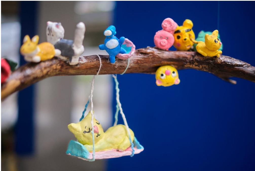
CHIJ Our Lady Queen of Peace, Childhood , 2020; image courtesy of Singapore Art Museum

Featuring both physical and digital programmes, SAM reimagines meaningful ways of connecting with their young audiences this school holiday.