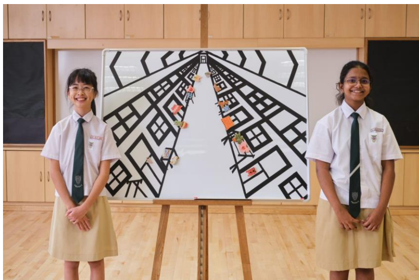
St Anthony's Primary School, Primary 4 students, Our HDB Corridors , 2020; image courtesy of Singapore Art Museum

In partnership with CHIJ Our Lady Queen of Peace, Geylang Methodist School (Primary), Haig Girls' School, Mayflower Primary School and St. Anthony's Primary School, SAM presents Between the World and Us – A Think! Contemporary Primary School Virtual Exhibition. This ninth edition of the Think! Contemporary Programme is the museum's first virtual showcase, exhibiting 18 artworks on the diverse experiences of Primary Four students in the