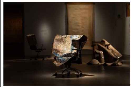
Installation view of Yee I-Lann's 'Flatten The Box' (2024).