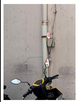
View of Pratchaya Phinthong's 'Spoon' (2024).

Melted lead and tin Collection of the artist