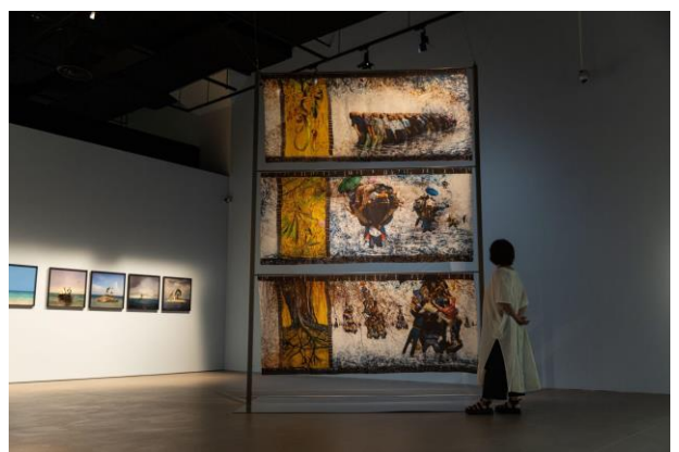
Installation view of 'Yee I-Lann: Mansau-Ansau'.

Yee considers herself a "reader" rather than a "maker" of photographs, often working with found images and collages to highlight embedded and underlying histories and narratives, thus providing an aesthetic space of observation and critique of visual representation and their alternatives. In