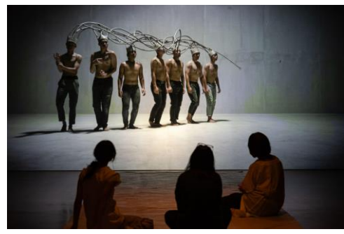
Installation view of Yee I-Lann's 'PANGKIS' (2021).

Video, Single-channel (video still) Collection of Singapore Art Museum