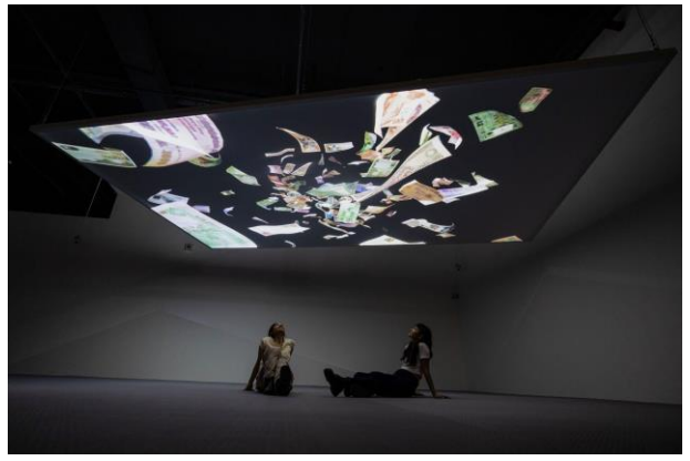
Installation view of Pratchaya Phinthong's 'Undrift' (2024).

No Patents on Ideas challenges the way we understand the world's systems—both seen and unseen—through a constellation of elements that reference airspace and aeronautics as an expression of freedom. Through his merging of found objects, relational significance and institutional negotiations, Phinthong underscores the idea that a trace or remnant may become shape-shifting epistemological conduits to an array of interconnected political and cultural notions. This moment is captured in the installations Undrift and Untitled (Singapore) , which occupy a central place within the exhibition. In Untitled (Singapore) , a photograph taken from Udon Thani in northeastern Thailand, captures the sky above the city with an F-16 fighter jet flying overhead as part of a military training exercise. The recurring presence of these jets is linked to a 15-year agreement between the Singapore and Thai governments to exchange resources and provide training facilities. Engaging the help of friends living in Udon Thani, Phinthong captures the aircraft as they appear, creating not only a record of military aviation but also a kind of map—encouraging audiences to rethink airspace, navigation, and control.