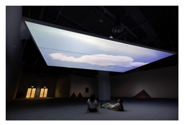
Installation view of Pratchaya Phinthong's 'Untitled (Singapore)' (2014).

Singapore, 3 December 2024 – Singapore Art Museum (SAM) proudly presents two compelling solo exhibitions of mid-career Southeast Asian artists Yee I-Lann and Pratchaya Phinthong, opening in Gallery 1 at SAM at Tanjong Pagar Distripark. Titled Yee I-Lann: Mansau-Ansau and Pratchaya Phinthong: No Patents on Ideas, these exhibitions showcase the practices of two leading artists from the same generation. Together, they reaffirm SAM's commitment to profile key Southeast Asian artistic practices and voices, driving global critical discourse on contemporary art by serving as a key platform for meaningful conversations within and around art.