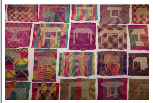
Detail view of Yee I-Lann's 'TIKAR/MEJA/PLASTIK' (2023).

also highlights the precarity of the craft and the indigenous knowledge belonging to the stateless coastal community, who are administratively rendered invisible even in post-colonial times.