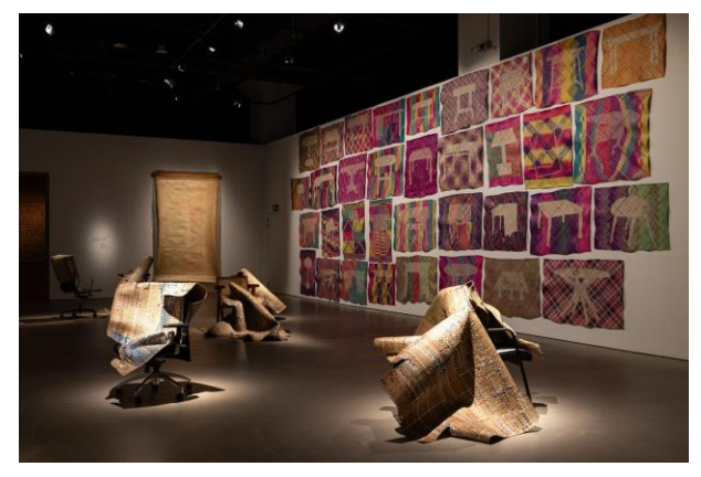
Installation view of 'Yee I-Lann: Mansau-Ansau'.

The exhibitions invite audiences to uncover perspectives on different Southeast Asian narratives through the two artists' practices.