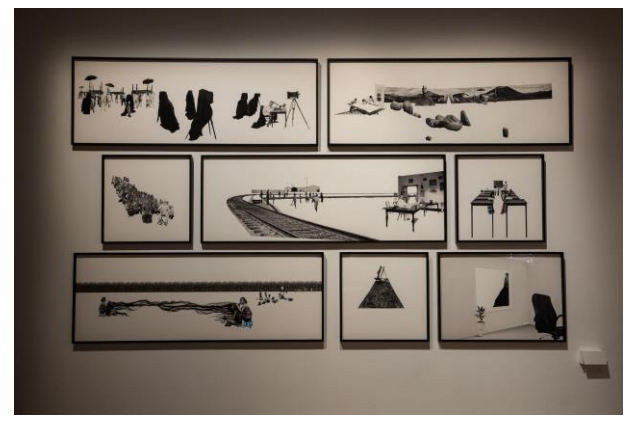
Installation view of Yee I-Lann's 'Picturing Power' (2013).

Sulu Stories , the shared seascape between Sabah and the southern Philippines unfolds in photomedia dioramas reflecting the histories of the community as much as the conflict. Yee's multi-layered visual vocabulary is further demonstrated in the The Orang Besar Series: Kain Panjang with Parasitic Kepala , Kain Panjang with Petulant Kepala , Kain Panjang with Carnivorous Kepala . "Orang besar" (big person) refers to those with economic wealth and sociopolitical influence. Applying the traditional batik technique to the familiar clothing of the kain panjang (long cloth), the work explores the complex relationship between the powerful and powerless in society.