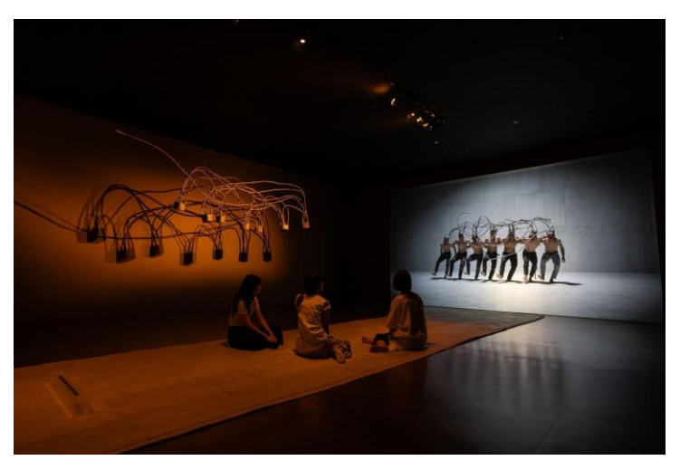
Installation view of 'Yee I-Lann: Mansau-Ansau'.

Yee's collaborations with sea and land-based communities bridge cultures, allowing audiences to discover and understand their particular circumstances and, by extension, speak to the human condition at large. PANGKIS , a video work titled after the unique warrior cry of the Murut in Sabah, captures the performance of the Tagaps Dance Theatre whilst wearing a customised and conjoined Murut lalandau jungle hat for an uncanny and powerful performance of new possibilities.