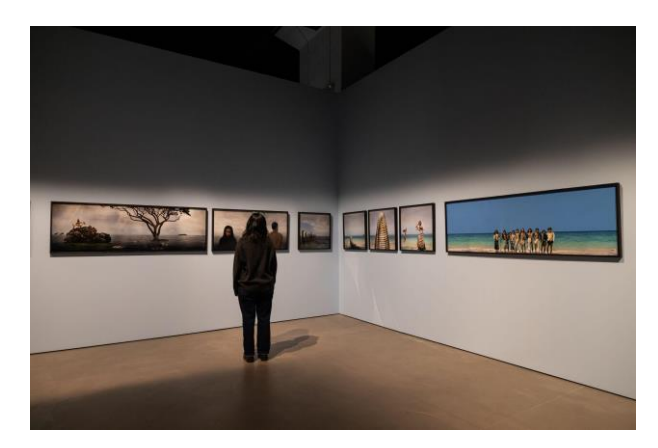
Installation view of Yee I-Lann's 'Sulu Stories' (2005).

Yee I-Lann: Mansau-Ansau presents recent and seminal works by Sabah contemporary artist Yee I-Lann, including two new commissions that reflect current aesthetic and material trajectories. The exhibition's title, Mansau-Ansau – a phrase meaning "to walk and walk" in the Dusun and Kadazan languages – symbolises an open-ended journey that encourages discovery for deeper cultural insights. The exhibition traverses two decades of Yee's creation, addressing historical and contemporary narratives and knowledge with a focus on power, identity, and community. Through these themes, Yee invites audiences to consider the forces that shape Malaysia and, extending beyond Southeast Asia, global cultural and aesthetic landscapes.