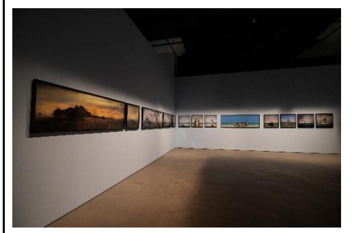
Installation view of Yee I-Lann's 'Sulu Stories' (2005).

Geographical proximity that enables travel, along with the tides of politics and history, form the visible and invisible lines that intimately connect Sabah with southern Philippines. This shared seascape is a storied space from which the artist's visual dioramas emerge, produced using digital collage to combine her photographs of seas and skies with images and information collected from archives and libraries. Layered upon their expanse are the myths and imaginaries of sea nomads and natives, the conflicts and alliances of colonial conquest and contemporary political manoeuvres, as well as the symbol and nature of wildlife, all held in place by a horizon that reveals, as much as it conceals, that which is above and below this common waterline.