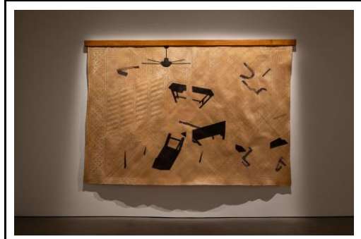
Installation view of Yee I-Lann's 'The Tukad Kad Sequence #01' (2021).