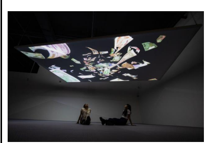
Installation view of Pratchaya Phinthong's 'Undrift' (2024).

In Undrift , Phinthong recreates a stock screensaver previously downloaded onto his personal computer by a Bangkok-based computer repair shop. Banknotes from hundreds of foreign currencies have been animated to soar and fall across the screen, their rate of movement reflecting wind speed readings gathered from meteorological stations across Singapore. These notes are from Phinthong's personal collection, and traces of his ownership can be seen in the folds and handwriting that appear on them. Phinthong's subtle intervention into a generic, ready-made good recalls his use of commonplace materials, processes, and symbols to highlight global systems of value, labour, and exchange.