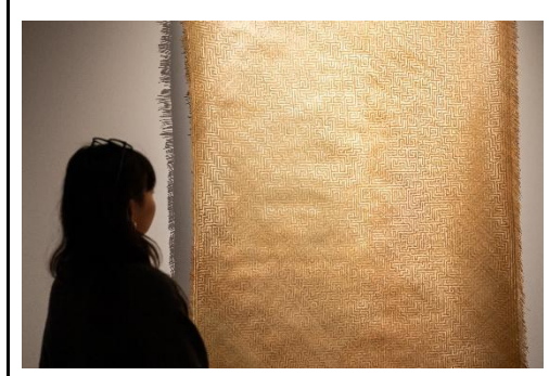
Detail view of Yee I-Lann's 'A map of Mansau-ansau' (2024).