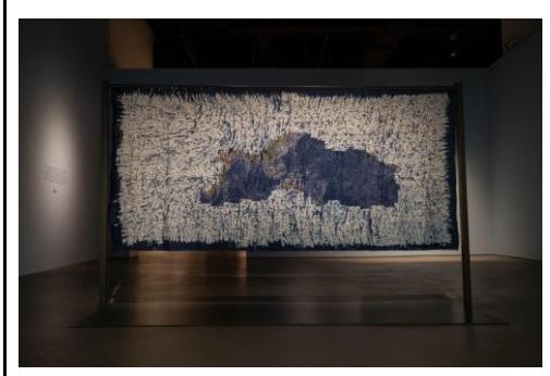
Installation view of Yee I-Lann's 'Fluid World' (2010).

Fluid World is a maritime map with Southeast Asia as its centre, produced using satellite images archived by Google Maps. It presents the historical and international reach of the peoples of the region travelling across and around the world. This watery territory has witnessed many attempts at definition and division—voyages to expand empire, colonial claim, and the sovereignty of national borders and seas of our present time. Paradoxically, this space of contest and struggle is in pursuit of a sense of belonging and home. The batik effect is derived from a method of wax resist that prevents dye absorption, routing and rerouting dye between its fissures and cracks. In its reimaging for a reimagination, Fluid World is a reminder of the intrinsically unfixed assignment of geography that can change like the random cracks in batik wax through which dye flows.