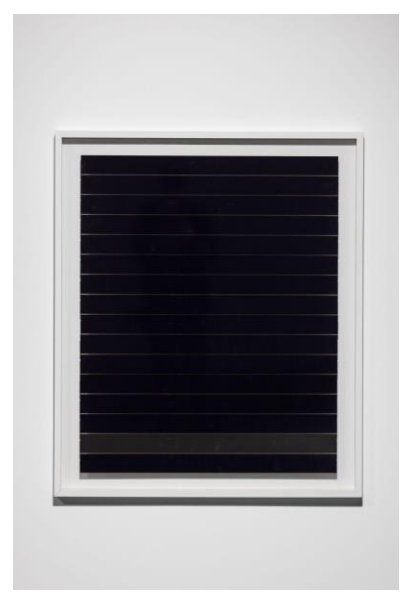
Installation view of Pratchaya Phinthong's 'Suasana' (2015).

real-time wind speed data from meteorological stations across Singapore. This reinterpretation of a commonplace digital object illustrates Phinthong's use of generic, readymade goods to highlight global systems of value, labour, and exchange.