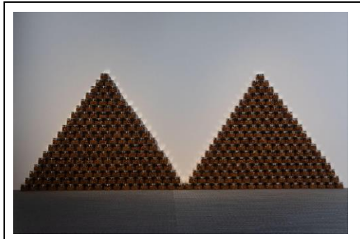
Installation view of Pratchaya Phinthong's 'Nam Prik Zauquna' (2024).

exemplifies the very conditions of the informal economy—its semiotics, socioeconomic implications and cultural mythologies. By inviting the public to share and consume the work, the artist opens up a communal space in which a dialogue between the artist and audience becomes possible, and in which the various meanings of the work can begin to coalesce.