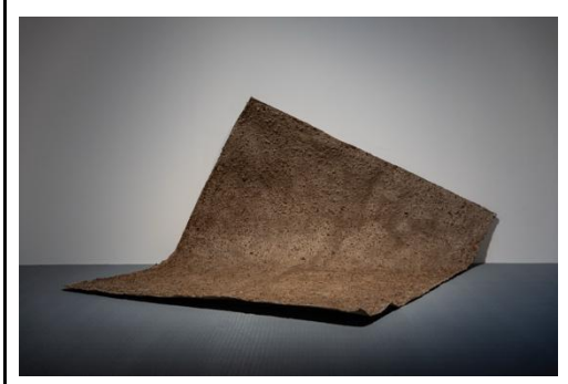
Installation view of Pratchaya Phinthong's 'Sacrifice depth for breadth' (2023).

Handmade paper and hornets' nest; Series of single-channel videos uploaded onto YouTube, between 47 sec to 4 min 10 sec Collection of the artist