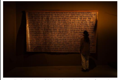
Installation view of Yee I-Lann's "hello from the outside" (2019).

Voices and memories also conjoin in karaoke's embrace. "hello from the outside" weaves together songs that have become popular across communities and peoples, their lyrics inevitably causing one to sing along when read.