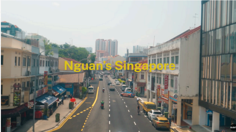
Stills from Learning Gallery | Nguan's Singapore, 2024.