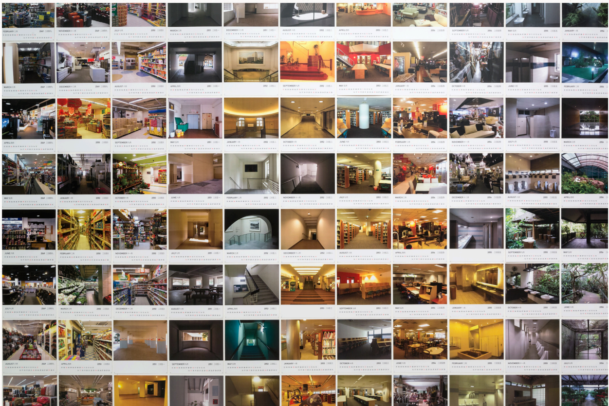
Installation view of Calendars (2026–2096) , 2004–2010.