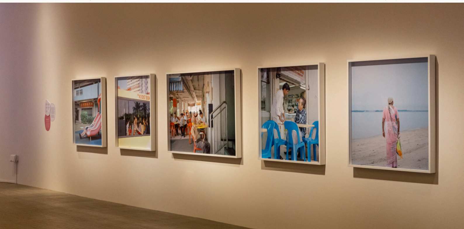
Installation view of Untitled, from the series Singapore, 2011-2013.