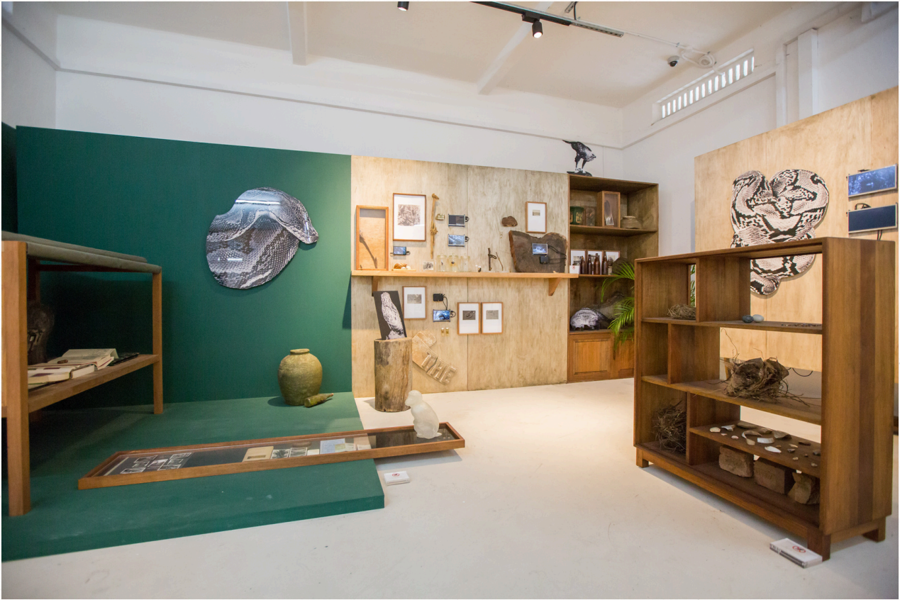
Installation view of Queen's Own Hill and its Environs , 2019.